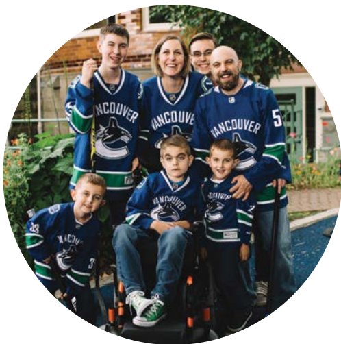
The Letcher family