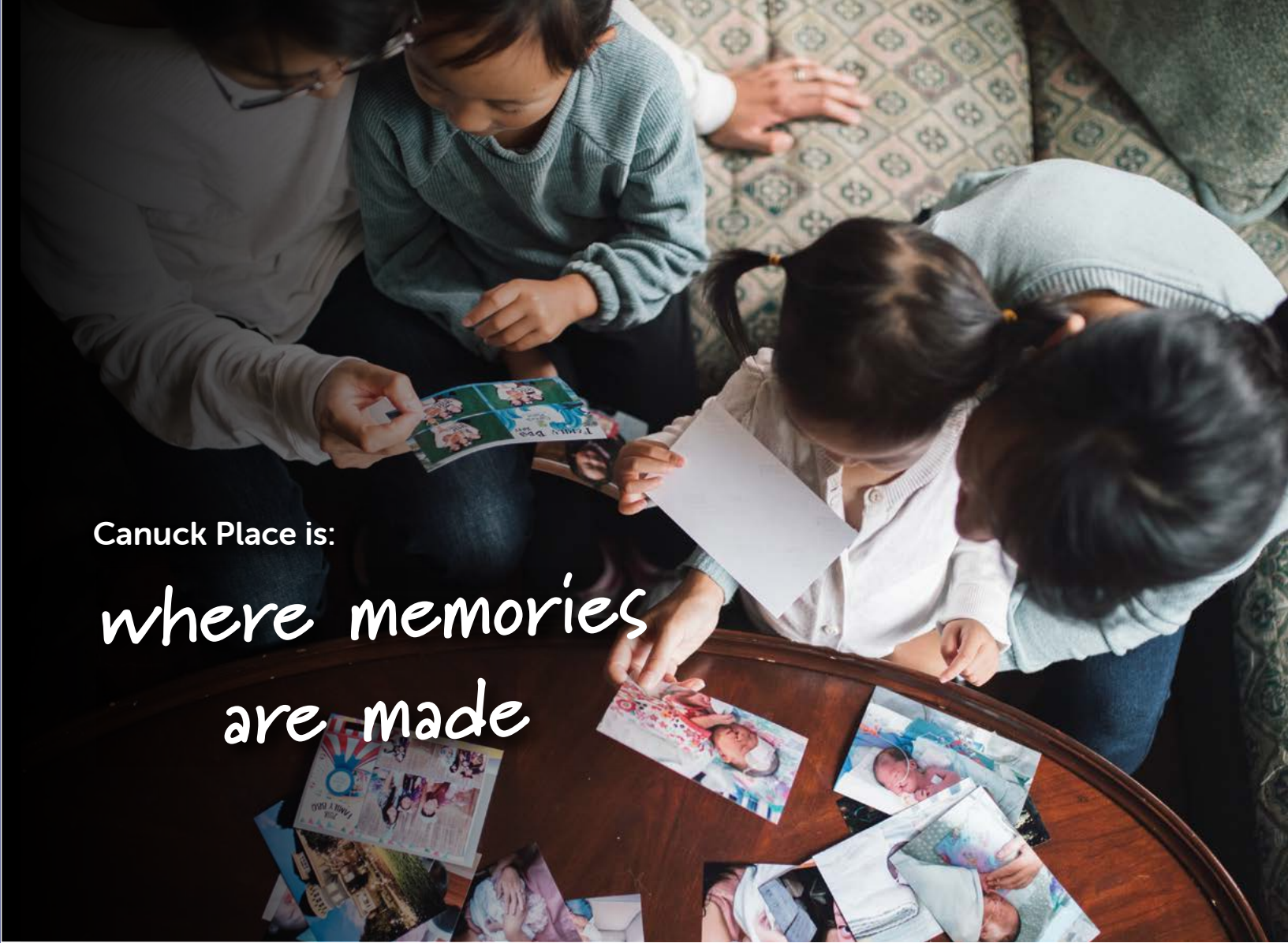
Canuck Place family, the Suis