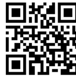
Service Provider Survey

They are gathering insights on the current state, needs, and strengths of pediatric palliative care in Canada through a Provider Survey, and a People with Lived Experience Survey. There are two surveys: