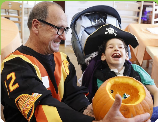
Canucks Alumni, Stan Smyl, bringing the fun to pumpkin carving!