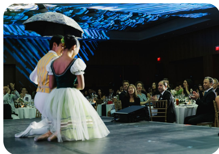
Gift of Time gala audience captivated by the stunning performance.