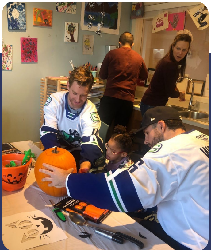
Abbotsford Canucks players carving pumpkins with Canuck Place kids.