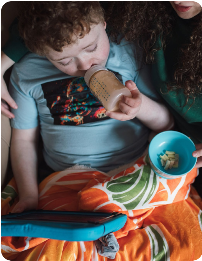
Wesley, Canuck Place Child