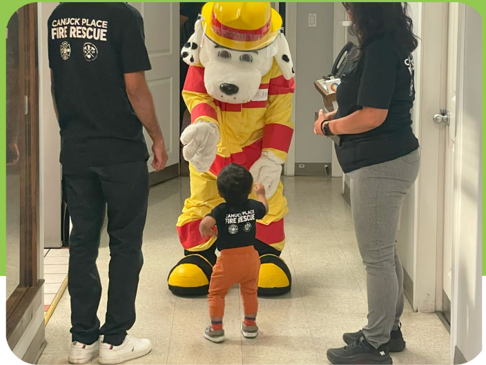
Canuck Place children and families visit the Vernon Fire Department for Summer in the City.