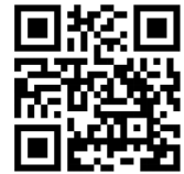
People with Lived Experience Survey